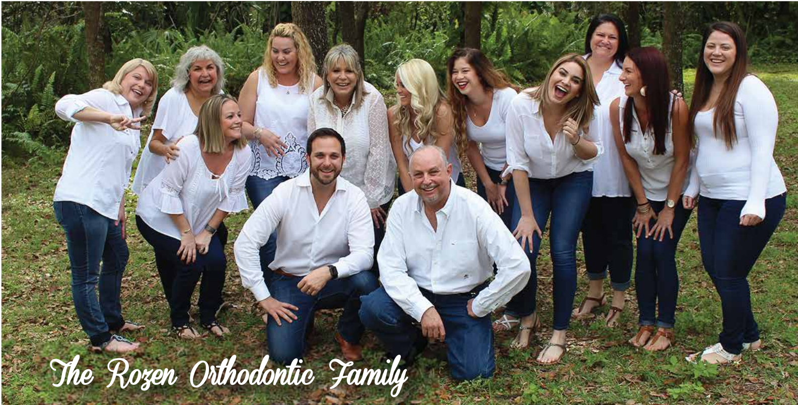
The Rozen Orthodontic Family

Let Rozen Orthodontics give you "A Walk of Fame" worthy smile before your Bar/Bat Mitzvah!